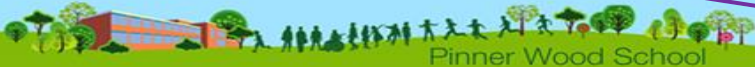
Pinner Wood School