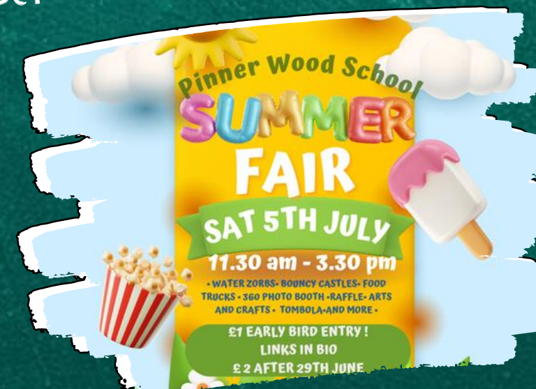
PWS Summer Fair Saturday, 5th July 2025