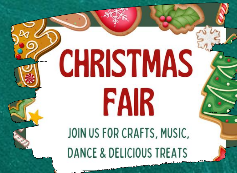
PWS Christmas Fair Friday, 6 December 2024