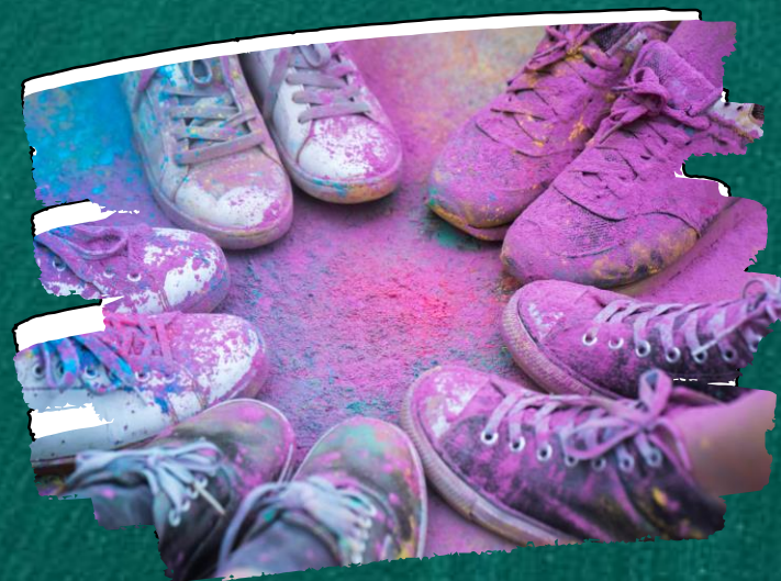
PWS Colour Run Friday 25th April 2025