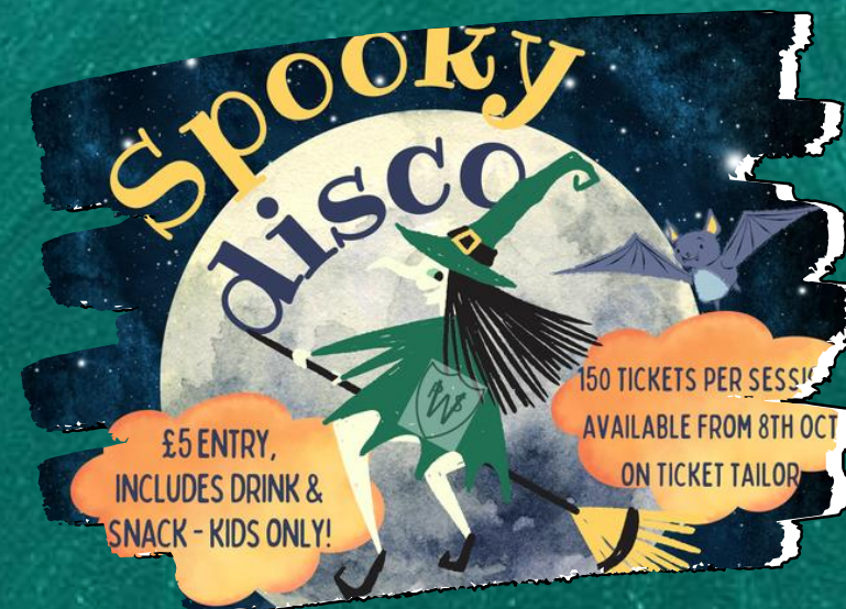
PWS Spooky Disco Friday, 8th November 2024