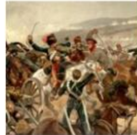
Crimean War 1853-1856